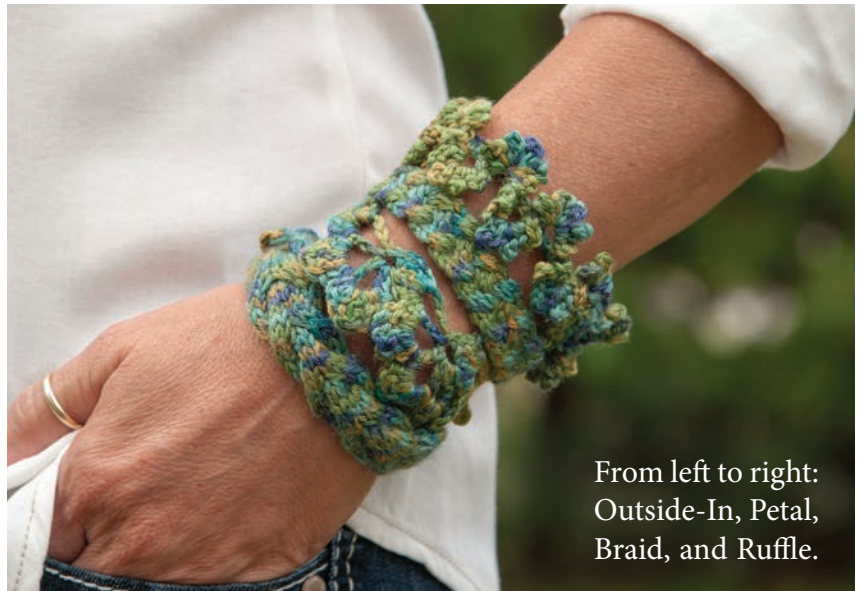
From left to right: Outside-In, Petal, Braid, and Ruffle.

2/2RC: Sl 2 sts onto cn, hold to back, k2, k2 from cn.