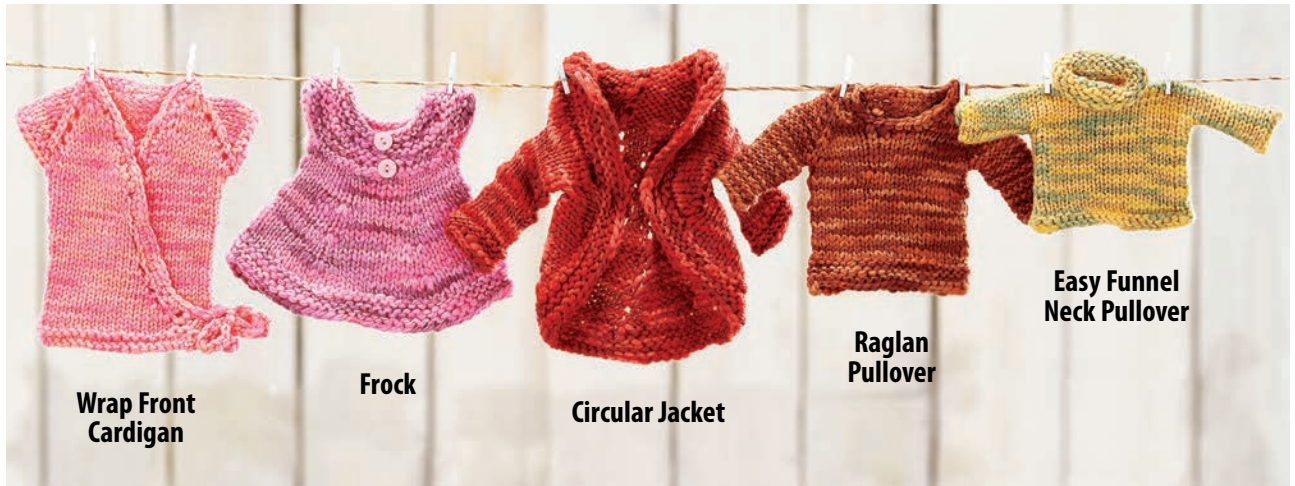
Wrap Front Cardigan