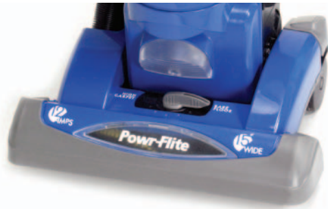
Brushroll window to alert user of problems.

Powr-Flite COMMERCIAL FLOOR CARE EQUIPMENT