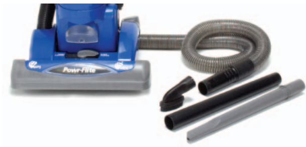
On-board cleaning accessories