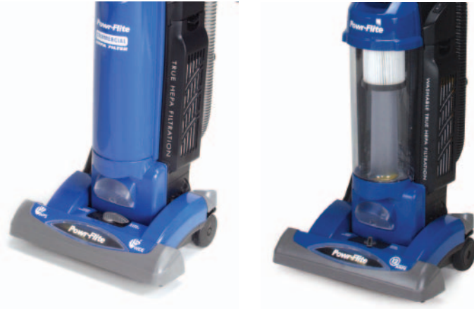
Sealed HEPA filtration system