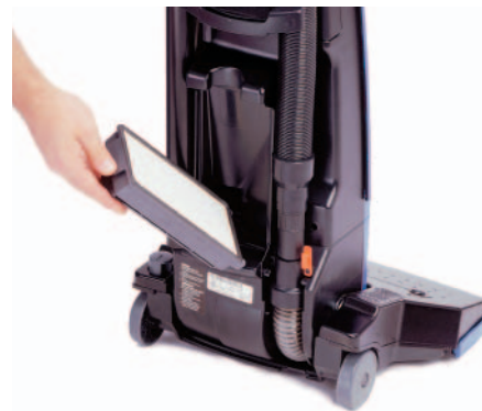
The PF80HF is the only commercial vacuum with True HEPA filtration

The PF80HF is easy to use, but tough enough to handle any job. It is made of heavy-duty polycarbonate with metal telescopic wands. The right offset design extends the reach of the vacuum so you can get under furniture or other obstructions easily. The all bristle ball-bearing brush roll gives you extra cleaning power... getting the dirt you can't see.