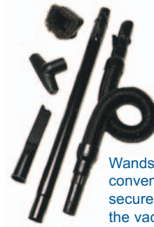
Wands and tools fit conveniently and securely right on the vacuum