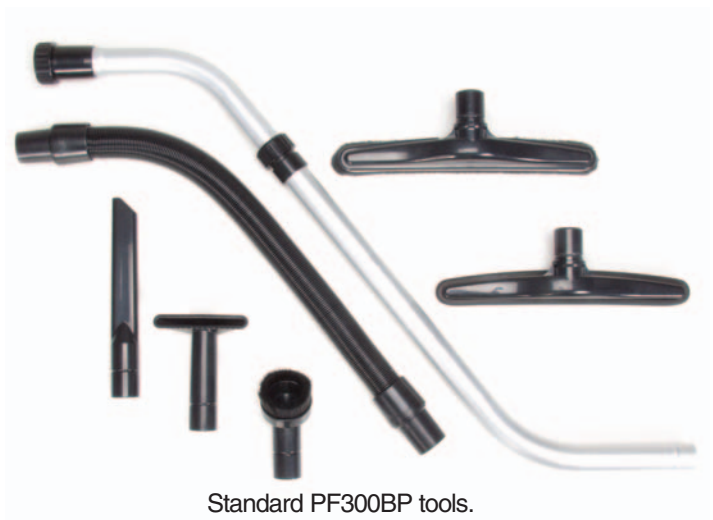
Standard PF300BP tools.