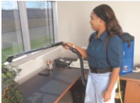
With a 5 foot hose the Powr-Pak DX has the reach and the tools for effective team cleaning.

Powr-Flite COMMERCIAL FLOOR CARE EQUIPMENT