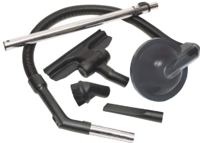
Standard PF20BP tools.