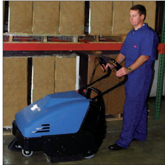
Deluxe Battery Sweeper