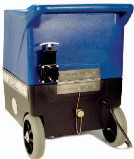
Outlet valve fits standard garden hose.

Carpets, rugs and furniture must be completely dried to prevent biological contamination. Water-borne contaminants and residue permeated through fabrics and carpet fibers can create foul odors and even toxicity in the air if not properly treated.