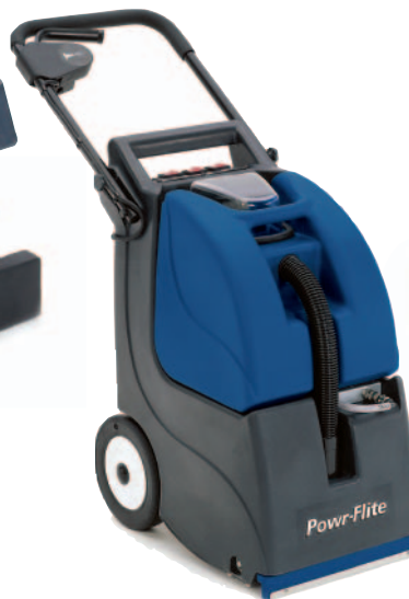
3 gallon model