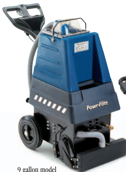
9 gallon model