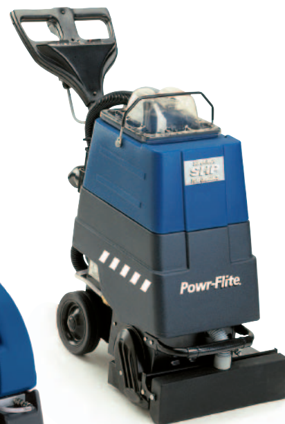
7 gallon model