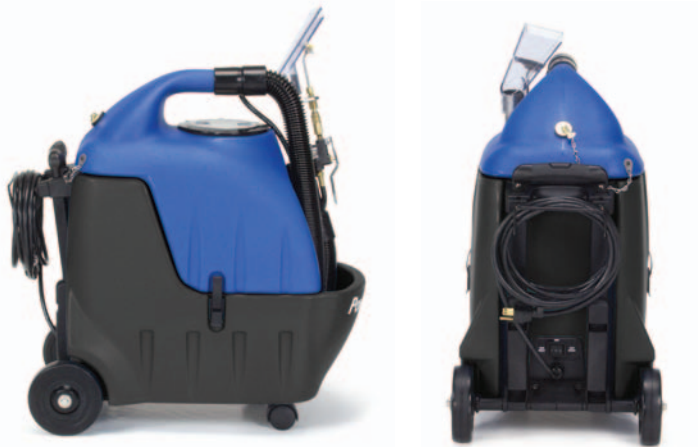
Sturdy aluminum telescoping handle for transport.