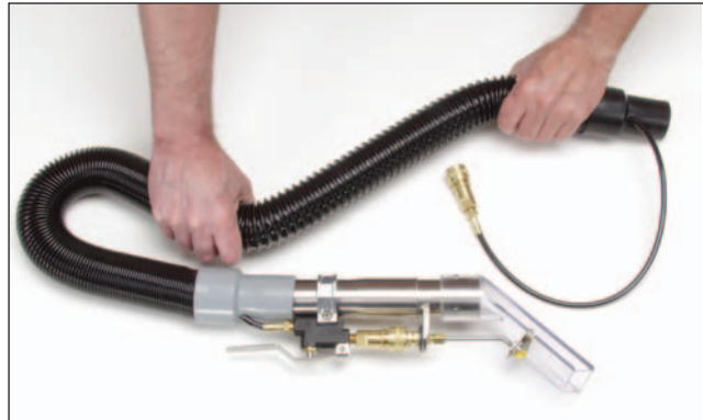
Stretch 2.5' to 10' insider vacuum and solution hose.

Powr-Flite COMMERCIAL FLOOR CARE EQUIPMENT