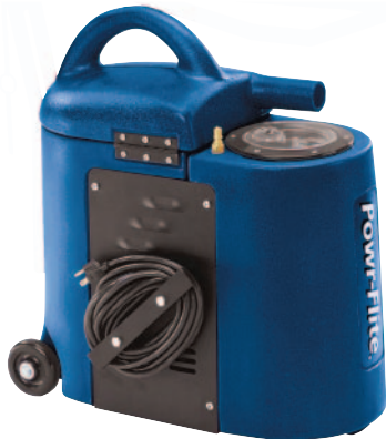
All steel cord wrap

The PS25 commercial spotter is portable, light-weight, and extremely powerful. It is perfect for touch-ups, spot removal between scheduled carpet cleanings, and those locations where the bigger extractors just won't fit. And, you can use it to pick up small wet spills quickly and easily. The PS25 takes the hassle out of cleaning spots before they become a major stain.