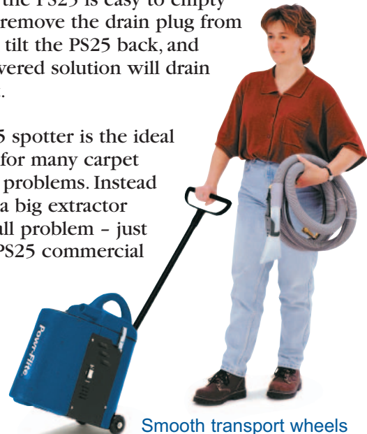
Smooth transport wheels

The PS25 spotter is the ideal solution for many carpet cleaning problems. Instead of using a big extractor for a small problem - just use the PS25 commercial spotter!