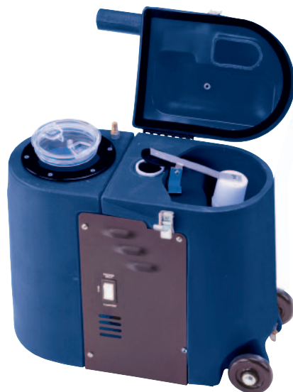
Float shut-off system for protection of vacuum motor

Power-Flite COMMERCIAL FLOOR CARE EQUIPMENT