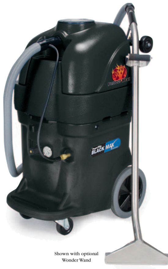
Shown with optional Wonder Wand

Black Max - the super charged portable extractor with truckmount power! With two 3-stage vacuum motors, Black Max provides the ultimate in portable extraction with 200" of water lift at 101 CFM. Combine that power to blast the carpet fibers clean with the strong 400 p.s.i. pump with the forceful recovery to dry carpets fast. The Black Max also features the patent pending Perfect Heat system for the hottest water temperature available in the portable market today. Dirt doesn't stand a chance! With the Black Max you get maximum power for super clean carpets that dry fast!