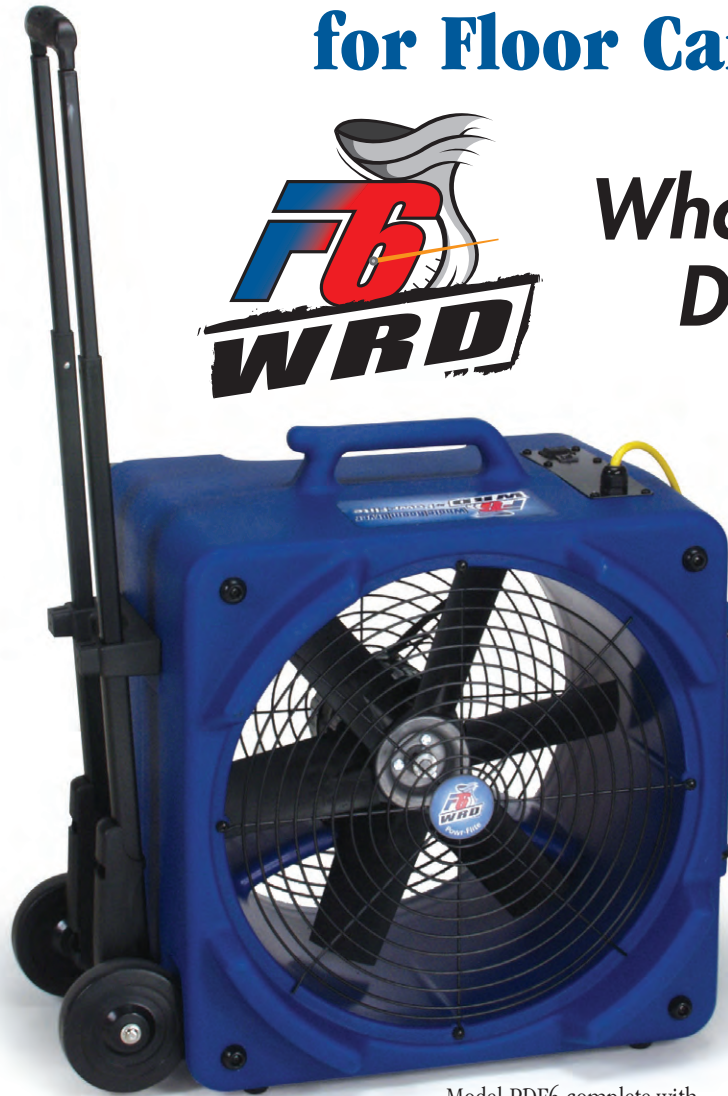
Model PDF6 complete with telescopic handle and wheels.