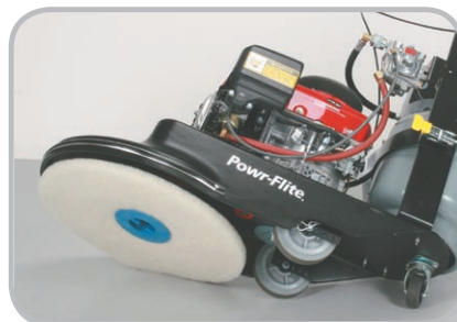
Tilt design for easy pad changes

Powr-Flite® high performance propane burnishers provide first class results year after year. At the heart of each unit are powerful Honda® (11 hp and 13 hp models) and Kawasaki® (17 hp models) engines which have been the choice of professionals for years. These powerful motors produce 1850 RPM and are mounted on rugged cast aluminum decks. Pads are mounted to flexible pad drivers which conform to the unique undulations in every floor, preventing burn spots. Adjustable and ergonomically designed handle reduces operator fatigue.