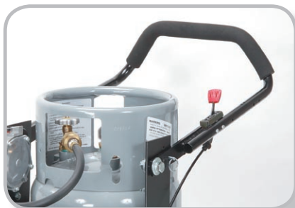
Handle adjusts for operator comfort