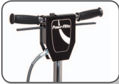
All metal handle with safety interlock feature